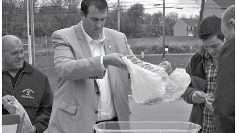
On April 30, I joined with the West Manchester Township Police Department to collect unused prescription and over-the-counter medicines as part of the Drug Enforcement Administration's National Take Back Initiative.